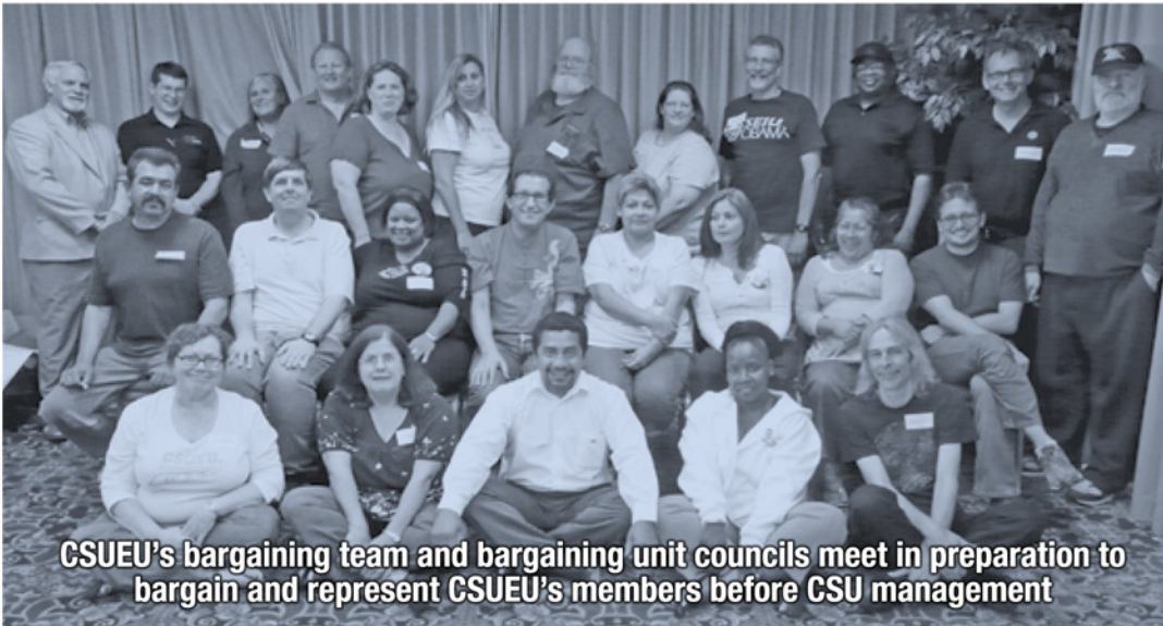
CSUEU's bargaining team and bargaining unit councils meet in preparation to bargain and represent CSUEU's members before CSU management