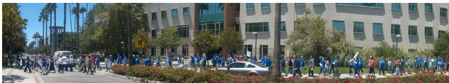
"Take a Stand!" rally, CSU Northridge, July 17, 2014