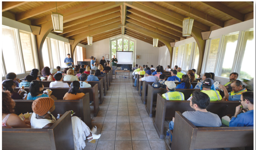
San Jose State ratification meeting

Members should receive their ratification ballots in the mail by September 30. Please contact Membership at membership@calcsea.org if you do not receive a ballot by that time, or call HQ at (866) 763-1452. CSUEU headquarters must receive mailed ballots by 5 p.m. on October 24.