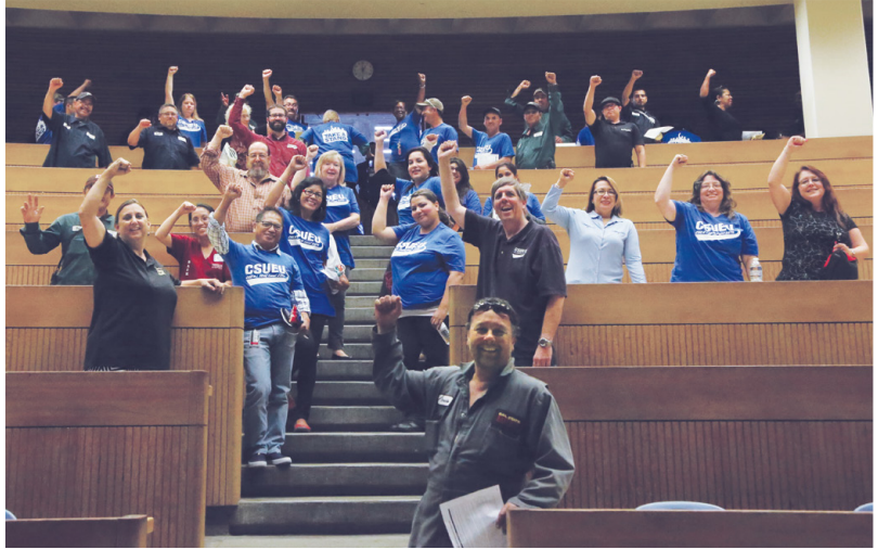
CSU East Bay Ratification Meeting

FY 2016/17. This is better than our previous language.